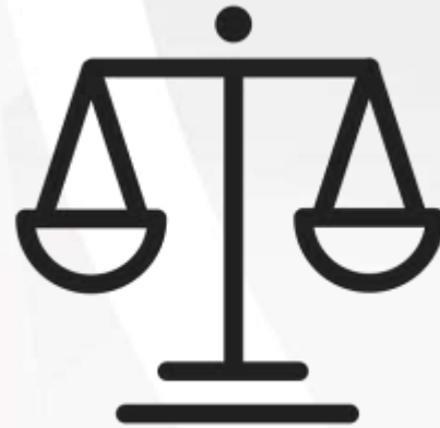
TAVOLA ROTONDA RCP NELLA SCUOLA